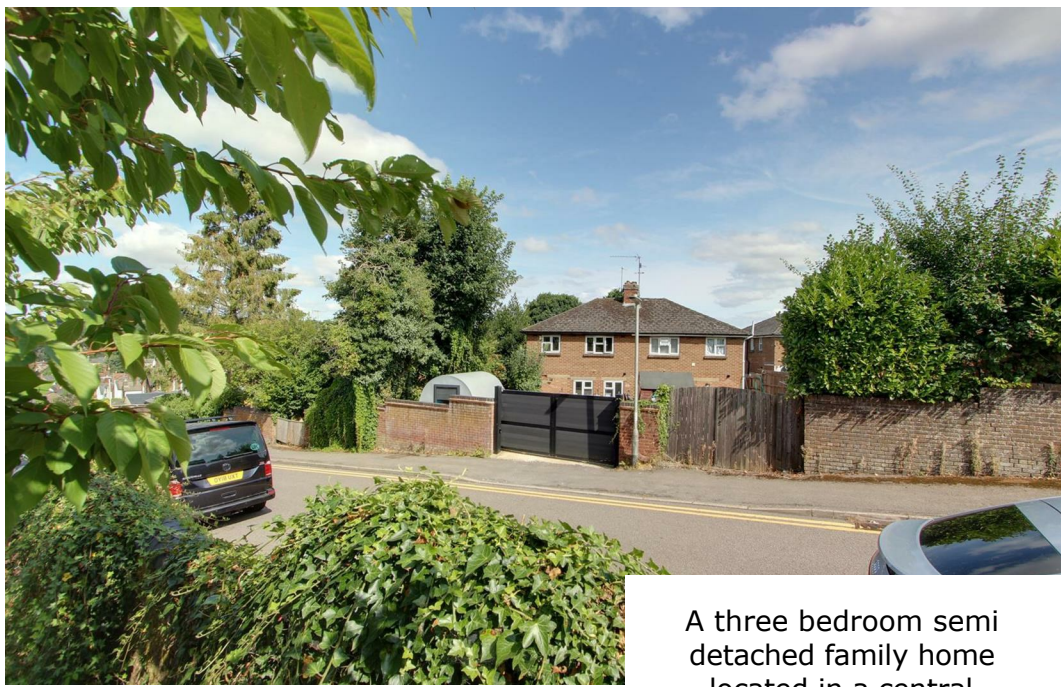
A three bedroom semi detached family home located in a central position close to both the High Street and station.